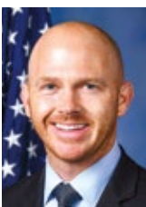
William Timmons [R] 4TH DISTRICT Greenville & Spartanburg Cos. 267 Cannon House Office Building Washington, DC 20515 Phone: (202) 225-6030 Website: timmons.house.gov