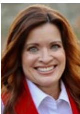
Sheri Biggs [R] 3RD DISTRICT Abbeville, Anderson, Edgefield, Greenville, Greenwood, Laurens, McCormick, Newberry, Oconee, Pickens & Saluda Cos. 1530 Longworth House Office Building Washington, DC 20515 Phone: (202) 225-5301 Website: sheribiggs.house.gov