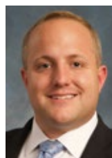
Russell Fry [R] 7TH DISTRICT Chesterfield, Darlington, Dillon, Florence, Georgetown, Horry, Marion & Marlboro Cos. 345 Cannon House Office Building Washington, DC 20515 Phone: (202) 225-9895 Website: fry.house.gov