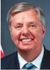
Lindsey Graham [R] 211 Russell Senate Office Building Washington, DC 20510 (202) 224-5972 Website: lgraham.senate.gov