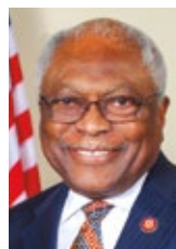
James Clyburn [D] 6TH DISTRICT Allendale, Bamberg, Calhoun, Charleston, Clarendon, Colleton, Dorchester, Florence, Hampton, Jasper, Orangeburg, Richland, Sumter & Williamsburg Cos. 274 Cannon House Office Building Washington, DC 20515 Phone: (202) 225-3315 Website: clyburn.house.gov