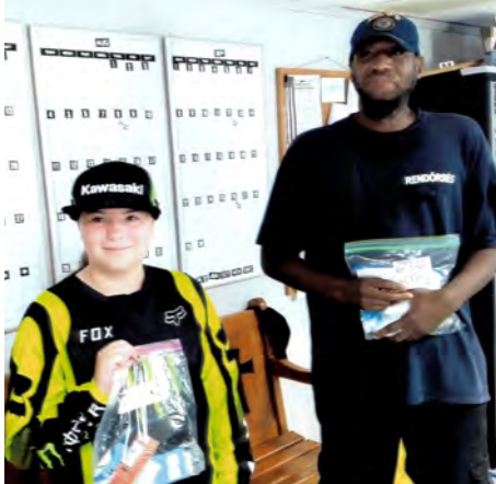
One of Hartleroad's student helpers gives a blessing bag to a veteran.