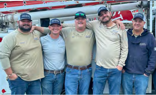
More than 50 Horry Electric employees answered the call to assist sister co-ops following the devastation of Hurricane/Tropical Storm Helene.