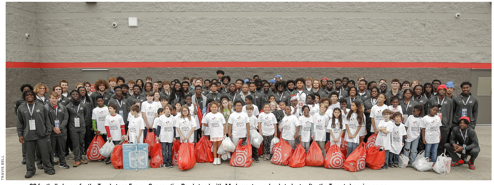
88 football players for the Touchstone Energy Cooperative Bowl stand with 44 elementary school students after the Target shopping spree.

and South team were responsible for manning the shopping cart as students crossed off items on their Christmas wish lists.