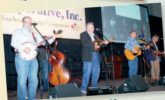
THE GENTLEMEN OF BLUEGRASS