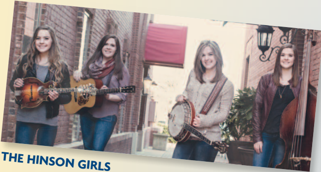
THE HINSON GIRLS