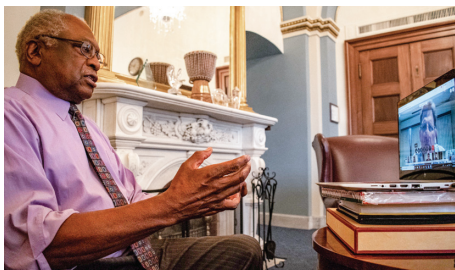
U.S. Rep. Jim Clyburn speaks to students during the 2020 Virtual Youth Experience.

Rather than missing out on an opportunity of a lifetime, the event