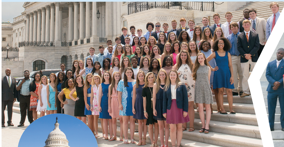
2017 S.C. Washington Youth Tour Representatives

Experience Washington, D.C., with 1,500 high school juniors from across South Carolina and the country, meeting lawmakers and touring all the sights. Your electric co-op will cover your round-trip plane ticket, tours and meals. In other words, it's all free!