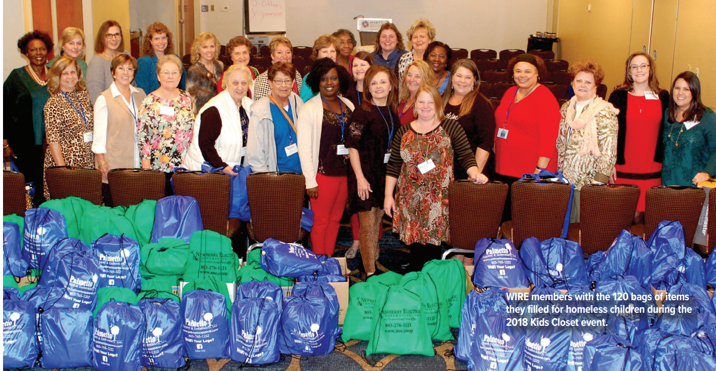
WIRE members with the 120 bags of items they filled for homeless children during the 2018 Kids Closet event.