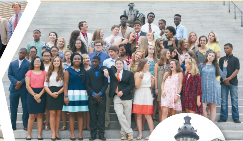
2017 Cooperative Youth Summit Representatives

Experience South Carolina's capital like never before. Tour the Statehouse, meet lawmakers and see how co-ops are preparing for our state's energy future. Plus, there's plenty of fun with visits to popular Columbia attractions like Riverbanks Zoo & Garden. Your electric co-op will cover all of your expenses.