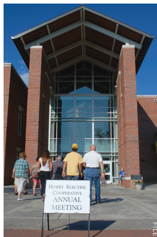
Horry Electric Cooperative's 2018 Annual Meeting will be held on Tuesday, May 8 at Coastal Carolina University. Registration begins at noon with the business meeting at 7 p.m.

which it was prepared, or if the Durable Power of Attorney is not received in the business office of Horry Electric Cooperative, Inc. no later than 30 business days prior to the scheduled meeting at which such vote is to be cast, the vote on behalf of the member will not be allowed.