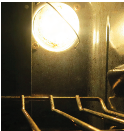
Use caution when replacing an oven light.

Why won't CFLs work? Instead of heating a filament until white-hot to produce light like an incandescent bulb, a fluorescent lamp contains a gas that produces ultraviolet (UV) light when excited by electricity. The UV light and the white coating inside the bulb result in visible light. Since CFLs don't use heat to create light, they are 75 percent more energy efficient. But the technology that cuts energy use doesn't stand a chance in an oven's 400+ degree heat.