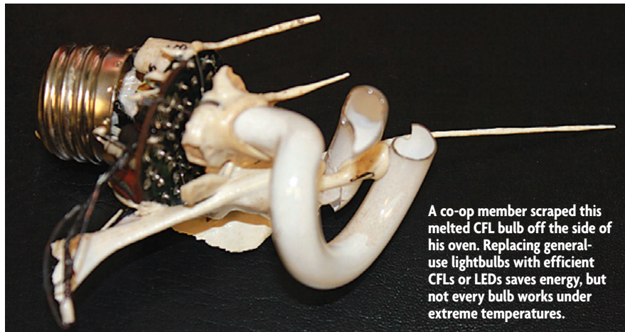
A co-op member scraped this melted CFL bulb off the side of his oven. Replacing general-use lightbulbs with efficient CFLs or LEDs saves energy, but not every bulb works under extreme temperatures.