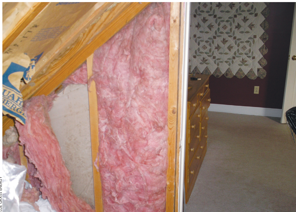
BLUE GRASS ENERGY

Itching to improve your home's energy efficiency? Read this first!