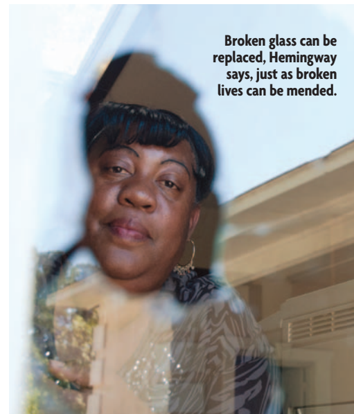
Broken glass can be replaced, Hemingway says, just as broken lives can be mended.

"This house will be a safe harbor but, more than that, we want to make sure they continue with their